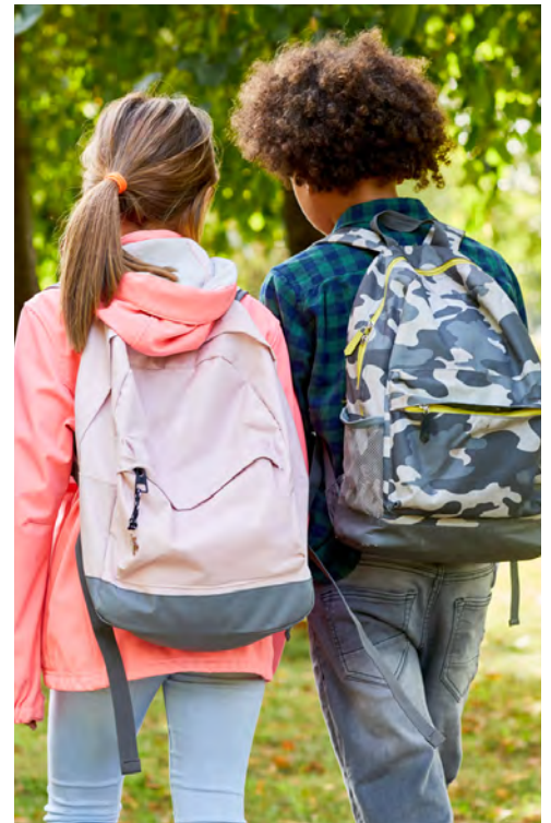
Copyright © 2021, Texas Education Agency. All Rights Reserved.