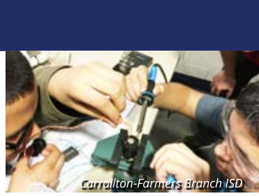
Carrollton-Farmers Branch ISD