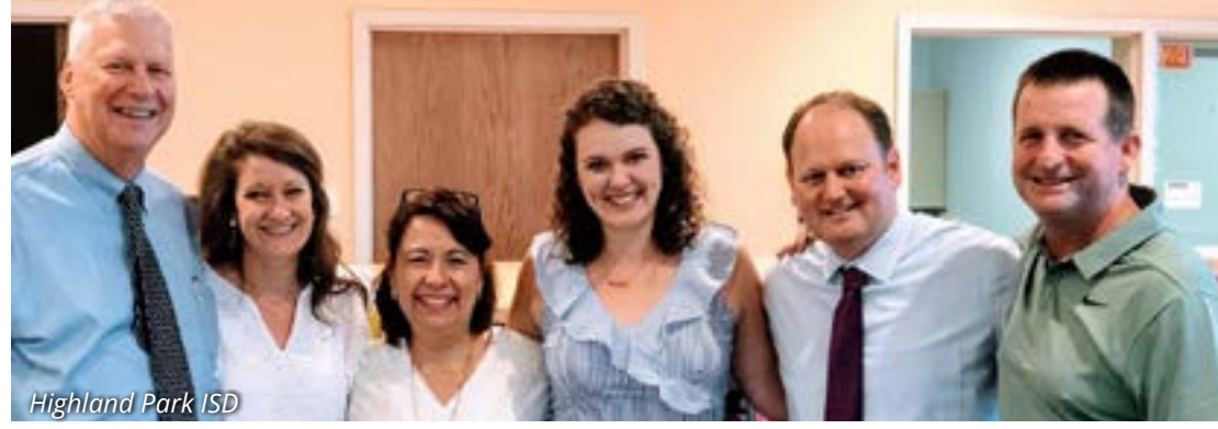
Highland Park ISD